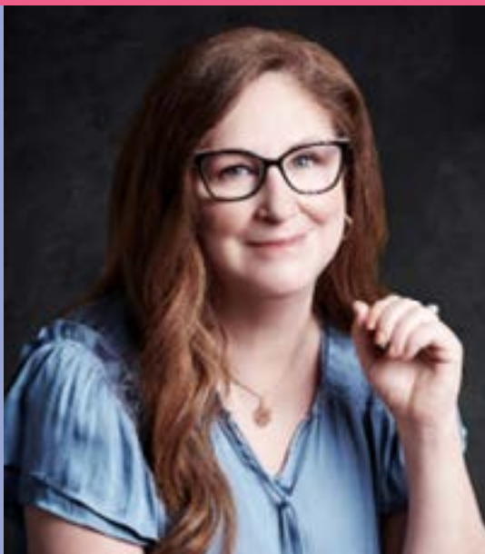
Dahlia Lithwick Keynote Speaker